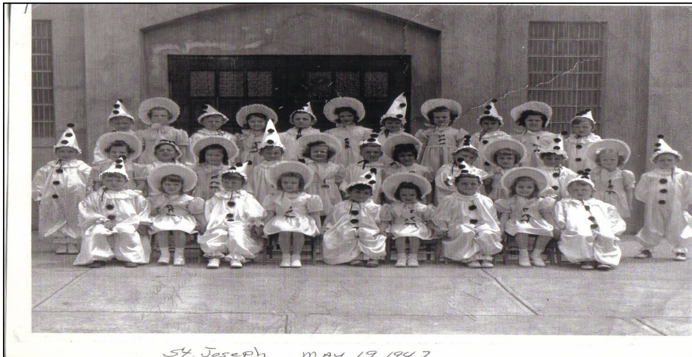
Photo taken on May 19th, 1947 in front of the Annex on Decatur Street.